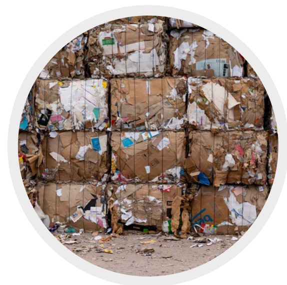
Finding more ways to recycle