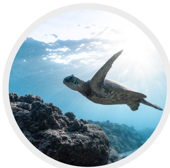
Keeping oceans clean